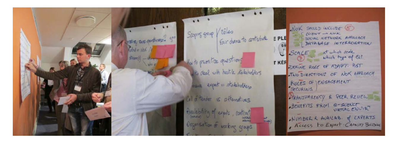
Figure 1 : Impressions from the regional workshops (Copenhagen) – voting on most important issues to be tackled by creating a NoK

The issues rated highest by participants where discussed in break-out groups, mainly the first four in the list. The following section summarize the main conclusions on the topics across the 3 workshops, which sometimes led to somewhat conflicting recommendations, thus also highlighting the different regional and knowledge holder perspectives. This is highlighted accordingly.